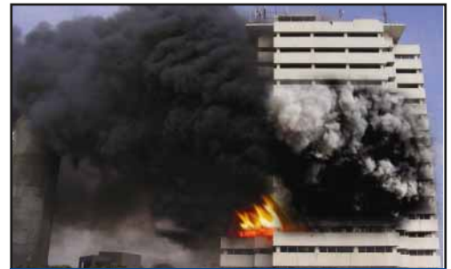
Building Fire Detection

Specialized software provides the needed speed of measurement to detect the build-up of heat or the outbreak of fire. The Foresight™ B-DTS offers greater range for sensing without reduction in spatial resolution 1 . A length of fiber can be laid out in a large grid to pinpoint a fire within a couple of meters. With 2.5 meters resolution for 20 km sensing range, the temperature can be measured with an uncertainty of only \pm 1.5 °C within a range of 0 °C to 100 °C, in less than 24 seconds.