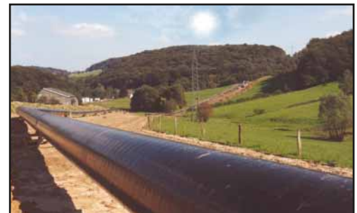
Oil and Gas Pipeline Monitoring

The Foresight™ B-DTS provides for real time and continuous monitoring as required for Oil & Gas reservoir management. Additionally, the Brillouin DTS offers key benefits over the widely deployed Raman DTS method. The B-DTS is a frequency based measurement; not intensity like Raman. This provides greater possibility to overcome loss and attenuation changes in the fiber. By using pure core single mode fibers, the lifespan is greatly enhanced against hydrogen darkening; this is in addition to the greater dynamic range of the Foresight™. Since single mode fibers are utilized, 5 cm spatial step and 1m spatial resolution of temperature events is easily obtained. Stable frequency measurements, greater dynamic range, longer fiber life, and better spatial resolution are key benefits that set the Foresight™ B-DTS.