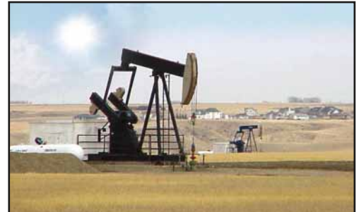
Oil and Gas Well Monitoring

Assess the integrity of pipelines with the use of the Foresight™ B-DTS. By measuring the localized changes in temperature associated with the leakage product from the pipeline, the B-DTS provides alarms and notification of events along the entire monitored area automatically. Such leaks result in cooling or heating, depending on the product in the pipeline, that is detectable using the B-DTS. Its enhanced range of performance and better immunity to hydrogen attenuation makes the B-DTS a logical choice in pipeline leakage monitoring.