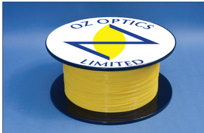
900 micron OD Fiber