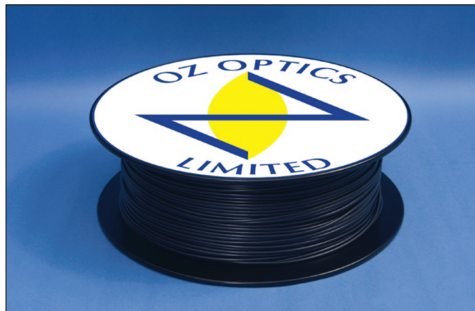
3mm OD Cabled Fiber