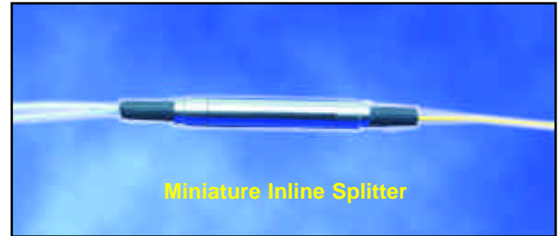
Miniature Inline Splitter

By default the output fibers on a polarizing splitter are aligned so that the output polarization from each fiber is in line with the stress rods of the fibers.