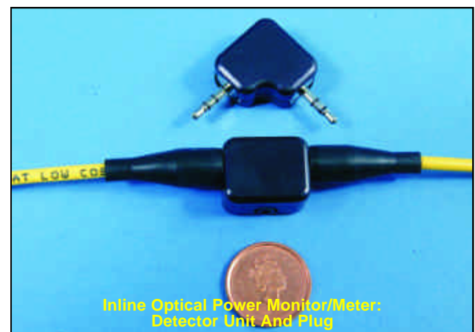
Inline Optical Power Monitor/Meter: Detector Unit And Plug