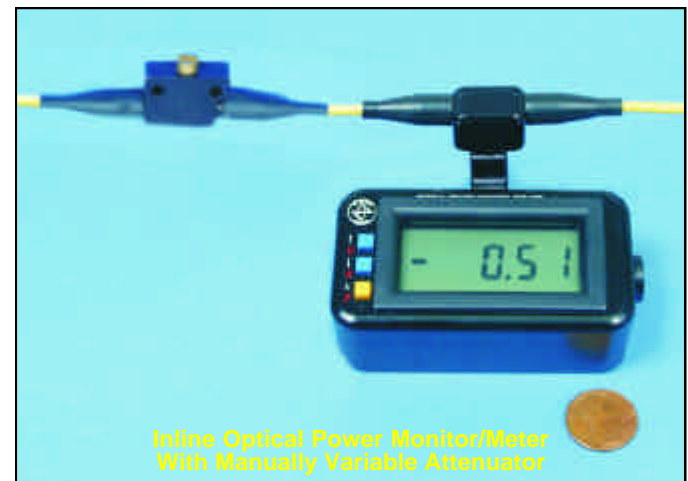
Inline Optical Power Monitor/Meter With Manually Variable Attenuator