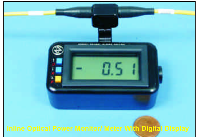
Inline Optical Power Monitor/ Meter With Digital Display

The OPM-200 is ideal for network monitoring, out of specification alarms, and/or DWDM systems for real time monitoring and feedback. Our inline taps are highly directional and ideal for monitoring traffic traveling in one direction only. It may also be used for measuring return losses instead of transmitted power. In the same product family, OZ Optics now provides OEM single channel optical power monitors and multi-channel power monitors for DWDM system integration.