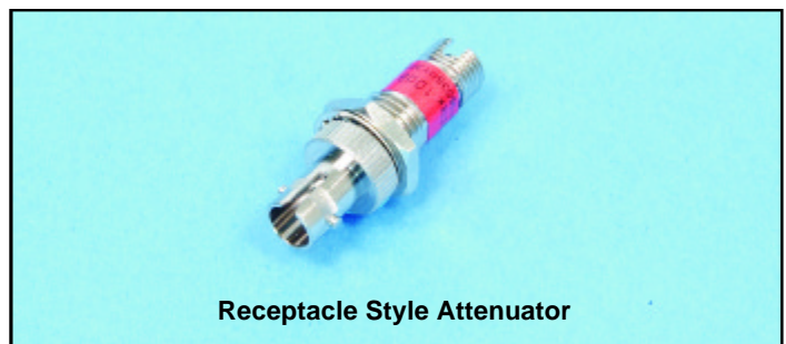
Receptacle Style Attenuator