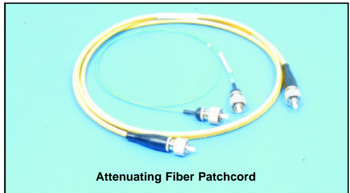
Attenuating Fiber Patchcord