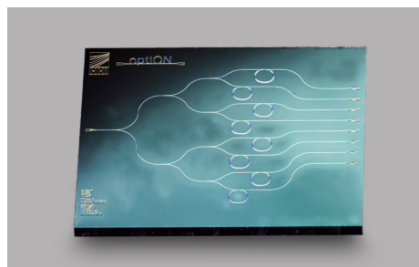
Eight Channel Photonic Sensor Chip