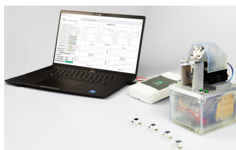
Optical Multi-Sensor Device