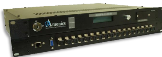
2U Rackmount Casing