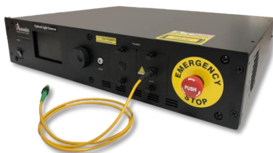
2U Rackmount Casing