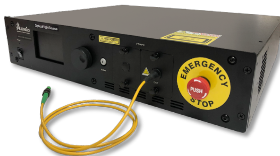
2U Rackmount Casing