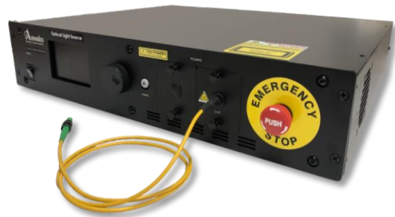
2U Rackmount Casing