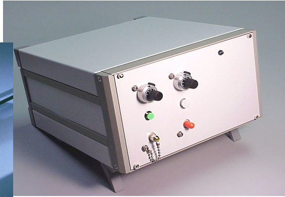
Instrument consisting of laser source and detector