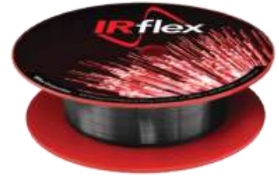
Attenuation Spectrum for IRF-Se series

IRflex's IRF-Se Series long-wave infrared (LWIR) fiber, made from extra high purity chalcogenide glass As_2Se_3 , is specially designed and manufactured to generate and/or guide mid-infrared wavelengths from 1.5 to 10 \mu m with high transmission efficiency and nonlinearities about 1000 times that of silica glass fiber.