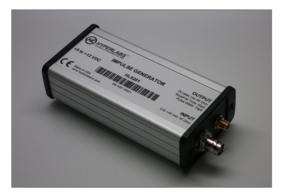
Figure 1: HL9201 Triggerable Impulse Generator (50 ps)