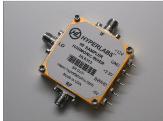
Figure 1: HL9313 Sampler / Harmonic Mixer

* NOTE: Harmonic distortion measurements taken under test conditions: LO = 1 GHz + 5 dBm, Pin = 100 MHz 0 dBm.