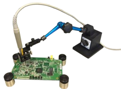
FP40-UA16 holding an RF Probe