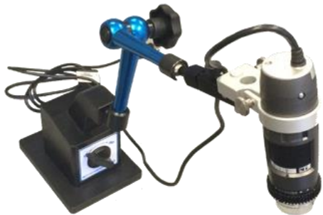
FP40-HDM1 holding a Dino-Lite USB microscope

With HDM1 adapter specifically for Dino-Lite microscopes and small lockable magnetic base, FP40 ensures engineers can place the microscope close to DUT to facilitate accurate probing.