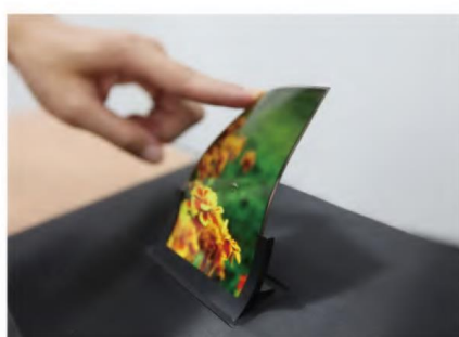
OLED屏加工 OLED processing