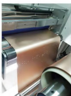
UV钻孔 UV drilling