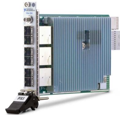
National Instruments PXIe-7902 card