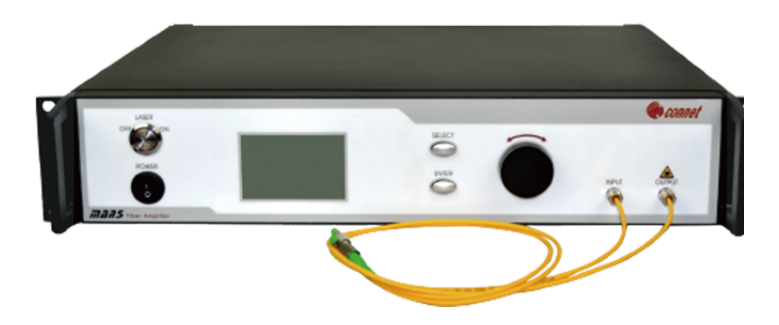
C-Band PreAmp EDFA