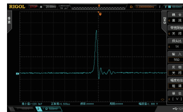
PIN signal and amplitude

All the data in the above table are the typical values obtained from the tests at room temperature of 25 °C , and the final data is subject to the final test report.